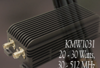
KMW1031 20 - 30 Watts, 30 - 512 MHz

For more information, call us at 425-485-9000 or visit us at www.ar-worldwide.com .