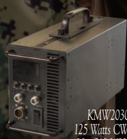
KMW2030 125 Watts CW, 30 - 512 MHz