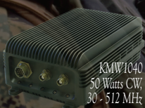
KMW1040 50 Watts CW, 30 - 512 MHz