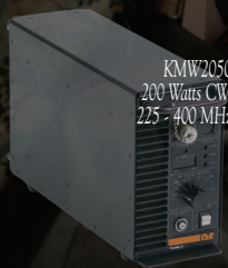
KMW2050 200 Watts CW, 225 - 400 MHz