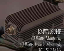
KMW1030HP 20 Watts Manpack, 40 Watts Vehicle Mounted, 30 - 512 MHz