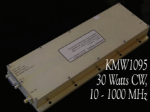
KMW1095 30 Watts CW, 10 - 1000 MHz